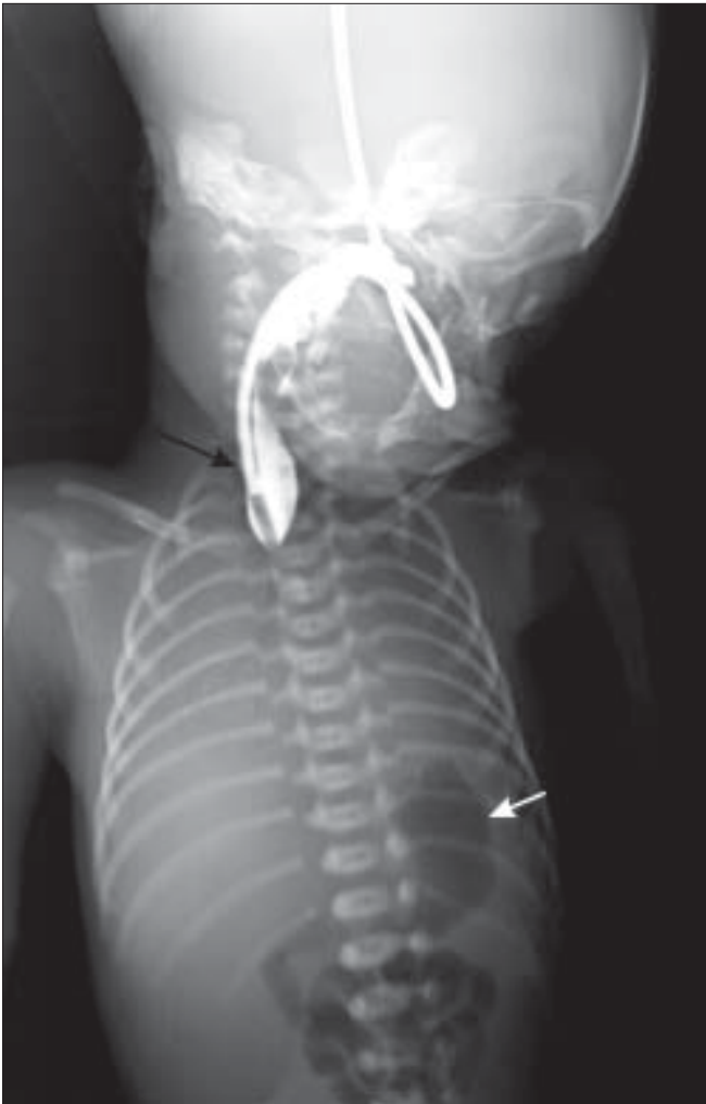
Figure 4: Chest radiograph of the baby with contrast shows the blind-ending upper end of the esophagus (black arrow) and the gas-filled stomach (white arrow)

delivered a male baby vaginally. The baby, however, died immediately after birth.