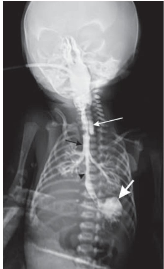
Figure 5: Chest radiograph of the baby with contrast shows the blind-ending upper end of the esophagus (long white arrow), contrast in the trachea (black arrow), the lower end of the esophagus communicating with the trachea (black arrow head) and contrast in the stomach (small, thick white arrow)

delivered a male baby vaginally. The baby, however, died immediately after birth.