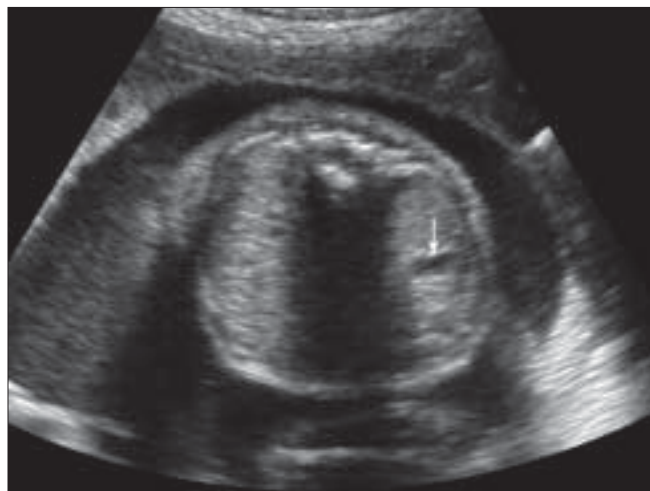
Figure 1: USG of the fetus in the transverse plane at the level of abdomen shows the small stomach (white arrow)

Ten days later the patient went into premature labor and