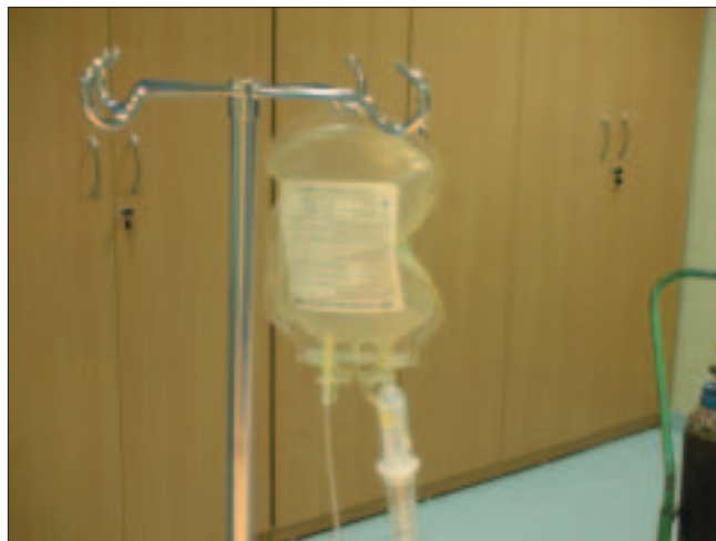
Figure 1: The blood bag inflated with CO 2 is depicted

The system developed at our institute has been used for CO 2 angiograms for many years now. It consists of a standard blood bag (readily available) connected to a CO 2 cylinder [Figure 1]; this is done in order to avoid direct transmission of pressure from the cylinder to the vasculature under