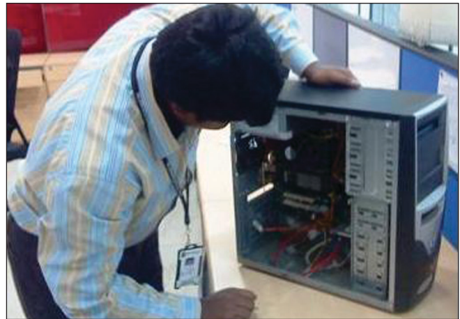
Figure 3: Hardware maintenance and periodic up gradation are keys to maintaining robust picture archiving and communication system infrastructure

Equally important is periodically scheduled preventive maintenance for both the application software as well as hardware. This includes, but is not limited to, points such as regularly clearing the viewer cache on workstations, defragmentation of workstation memory, updating antivirus definitions, and cleaning out the Windows registry [Figure 3]. PACS server preventive maintenance