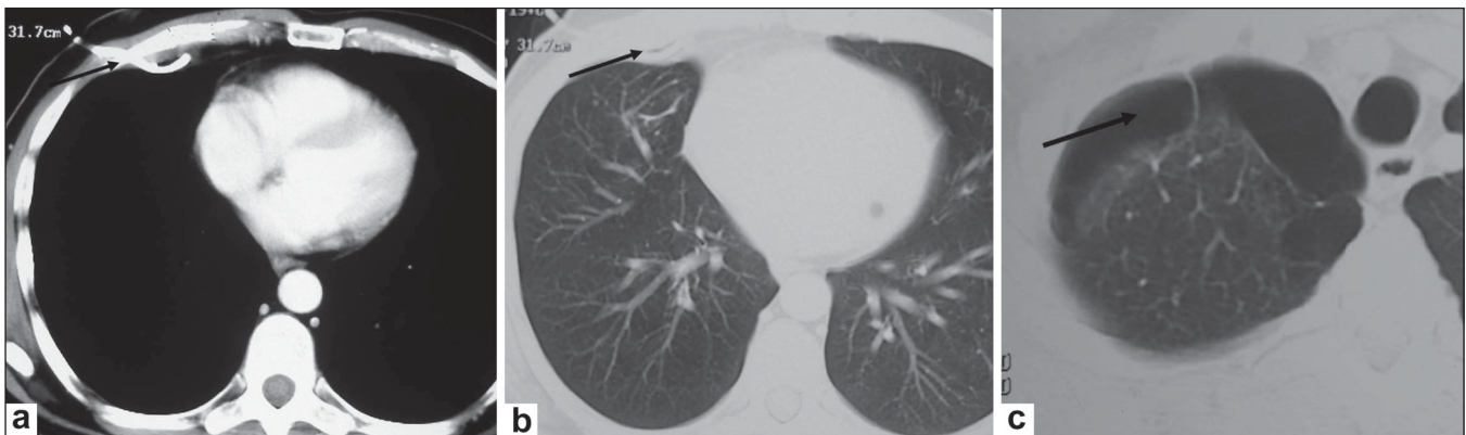
Figure 3 (a-c): Post-drainage axial CT scan of the chest done two weeks after the pigtail drainage. Mediastinal (a) and lung window (b,c) images show near complete resolution of the air-fluid level with the pigtail catheter in situ (arrows in a and b) along with multiple bullae (arrow in c) in the apical segment of the right lung

grown organisms. [2] The data on the causative organisms are very limited. Culture results from the aspirated fluid are available only in four previously reported cases of bullae containing air-fluid levels; three out of these four cases showed Pseudomonas aeruginosa , methicillin-resistant Staphylococcus aureus , and Bacteroides melaninogenicus , [2] respectively, while one was culture negative. The fluid aspirated from the bulla in our patient did not grow any organism. However, the patient had received antibiotics for one week prior to the aspiration.