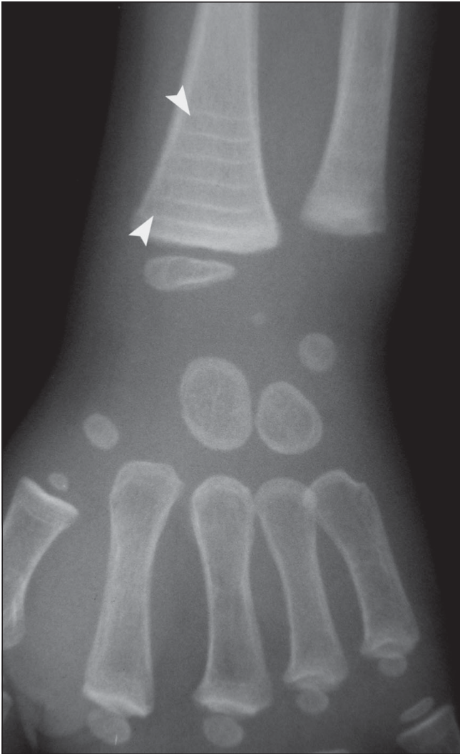
Figure 3: Posteroanterior radiograph of the wrist shows zebra lines (white arrow heads)

Faint metaphyseal lines seen in untreated children are called growth recovery lines. Transverse bands are also noted in heavy metal intoxication (lead), treated leukemia, healing rickets and chronic anemia; however, the sclerosis is not generalized and is more marked in the diaphysis. [1] In these situations, there is a period of growth suppression and subsequent recovery, which, if repetitive, results in multiple growth arrest lines. [6]