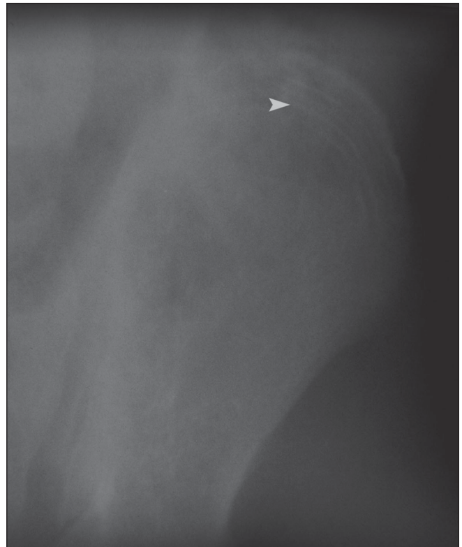
Figure 2: Frontal radiograph of the pelvic bones shows zebra lines involving the iliac crest (white arrow head)

The patterns of these zebra lines depend on the number of doses of intravenous pamidronate, the frequency of