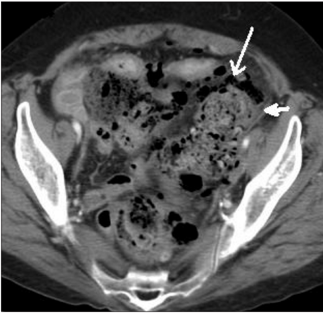
Figure 2: Contrast-enhanced axial CT scan demonstrates a fecaloma (arrow) in the proximal sigmoid colon and at the site of the perforation, with colonic wall thickening (arrowhead) due to pressure necrosis