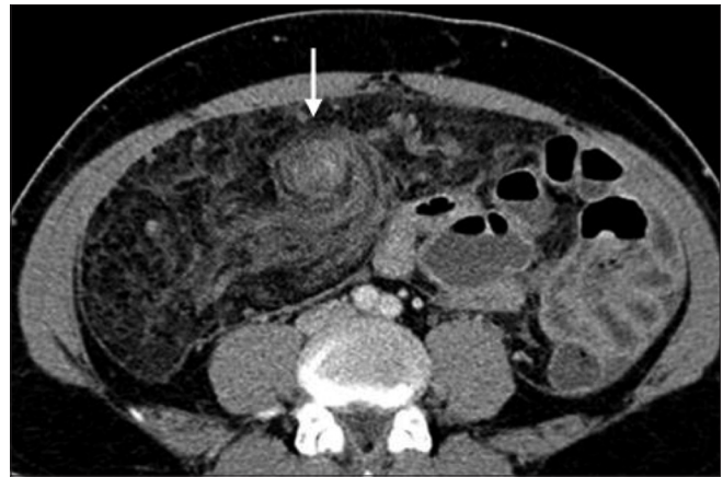
Figure 2: A contrast-enhanced CT scan shows a hazy right side of the greater omentum, with concentric hyperdensity (white arrow) and displacement of the bowel loops

The pathological process begins with omental congestion due to venous obstruction, which leads to an inflammatory response, adhesion formation, and finally, necrosis as a result of both venous and arterial obstruction. [4-8] Thus, torsion leads to omental infarction, which presents as abdominal pain. Omental infarction can also occur in