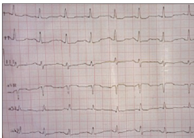
Figure 1c: Serial electrocardiograms