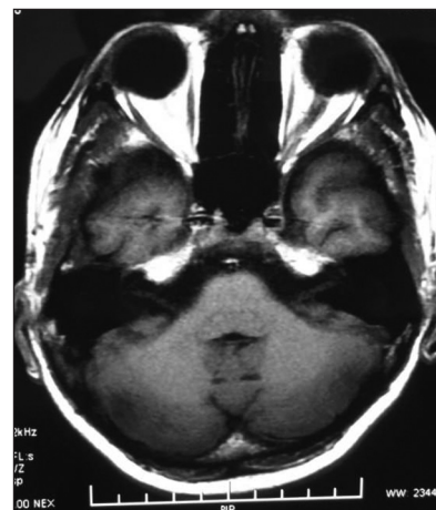
Figure 2: Magnetic resonance imaging (T1 sequence) showing thickening of the extraocular portion of the left optic nerve along with great edema without any intracranial abnormality