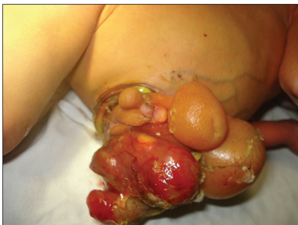
Figure 1: Clinical photograph at presentation

Immature teratomas occurring in infants often contain embryonic appearing neuroglial or neuroepithelial components, which may coexist with mature tissues. Their