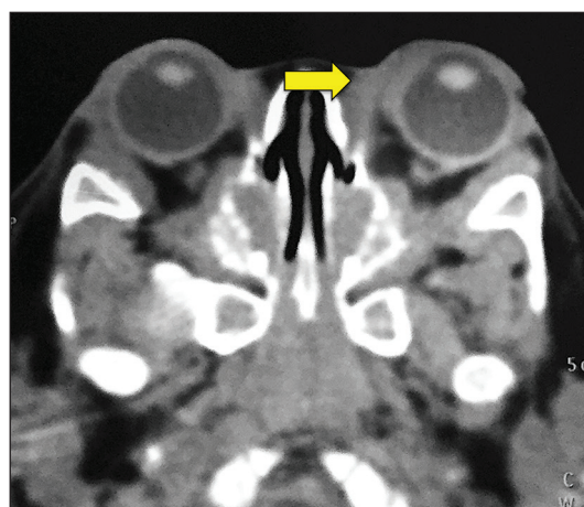
Figure 2: Depicts an axial computed tomography scan showing an ill-defined, isodense mass in the anterior orbit infiltrating the left medial rectus muscle (black arrow)

Departments of 1 Ophthalmology and 3 Pediatrics, Lokmanya Tilak Municipal General Hospital and Medical College, Sion, Mumbai, 2 Department of Ophthalmic Plastic Surgery and Ocular Oncology, Advanced Eye Hospital and Institute, Navi Mumbai, Maharashtra, India E-mail: akshaygn@gmail.com