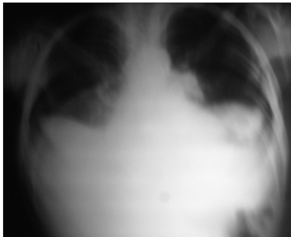
Figure 1: Chest radiograph showed no active focal lung lesion

Chest radiograph showed no active focal lung lesion, but the thoraco-lumbar spine showed a vertebral planner