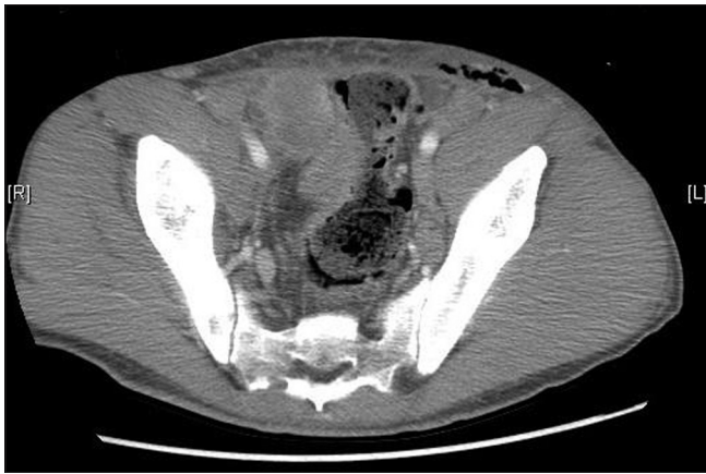
Figure 1: Large soft tissue extraperitoneal mass on CT scan

primary of the cancer, a testicular ultrasound was ordered to rule out any germ cell tumors and the results came back normal. At this time, various tumor markers were drawn, including CEA, AFP, and Ca 19-9; levels came back as 272.5, 4.8, and 69, respectively. Although it appeared likely to be from the biliary tract based on the ERCP, this was only speculation and did not entirely fit with the tumor markers.