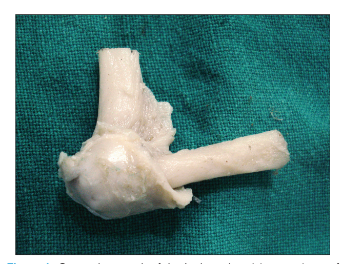
Figure 1: Gross photograph of the L shaped excision specimen of pseudoarthrosis, left tibia

Neurofibromatosis is one of the most common genetic