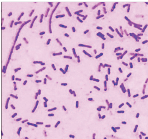
Figure 3: Gram staining showing subterminal spore in Gram-positive bacilli