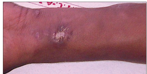
Figure 1: Photograph showing multiple ulcers and nodules over the forearm

A 15-year-old male child presented to our tertiary care trauma center with multiple non-healing ulcers on the left forearm since 2 months following trauma by a sharp object [Figure 1]. His general physical examination was unremarkable with stable vital