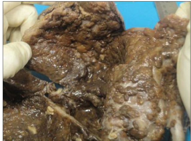
Figure 1: Gross picture of specimen of mesenchymal hamartoma

Currently, the pathogenesis of mesenchymal hamartoma is still under study, the hypothesis of its origin from synchronous abnormal mesodermal development has been postulated. It gradually enlarges up to large sizes, some can spontaneously regress and few can undergo malignant transformation to undifferentiated (embryonal) sarcoma. Karyotype study of undifferentiated embryonal sarcoma has revealed chromosomal rearrangement in 19q13.4, which is similar to that in mesenchymal hamartoma. [8] This can be the probable explanation for the fact that mesenchymal hamartoma is potentially a premalignant lesion and might be a precursor lesion to undifferentiated embryonal sarcoma.