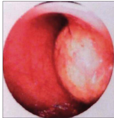
Figure 1: Colonoscopic photograph showing polypoidal growth obstructing the lumen just proximal to the sigmoid flexure

Submucous lipomas of colon are extremely rare, with a reported incidence of approximately 0.26%, [3] described initially by Bauer in 1757. They are more frequently seen in the large than in the