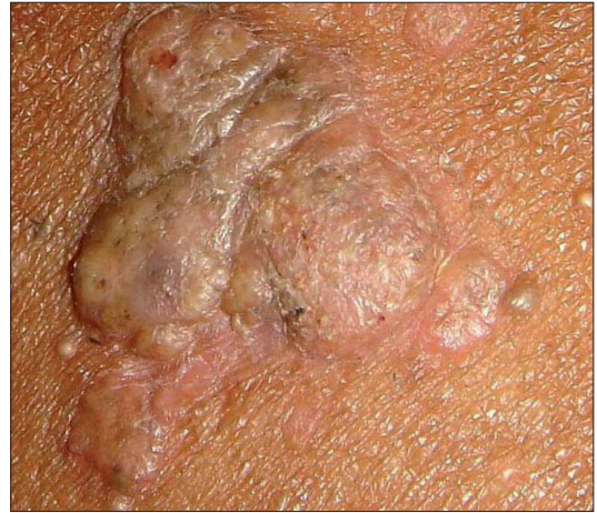
Figure 2: Nodular lesion over the back