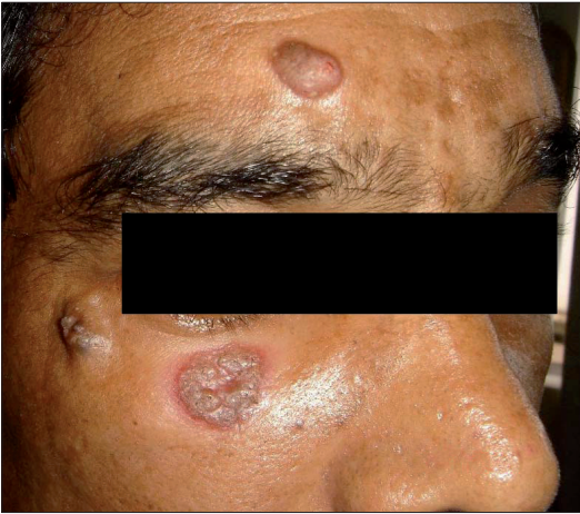
Figure 1: Plaque like lesions over the face