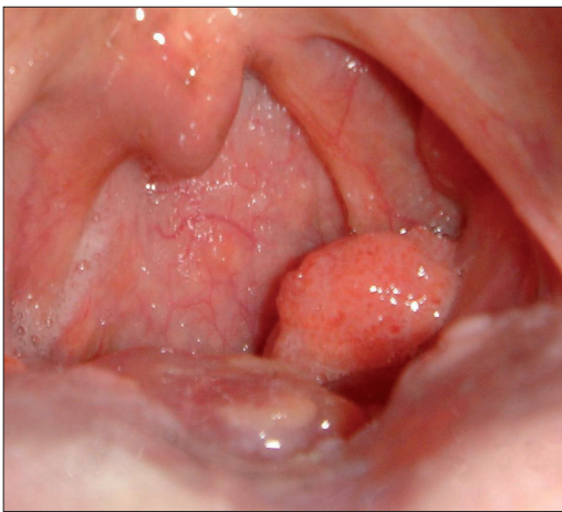
Figure 3: Polypoidal lesion at the base of the tongue