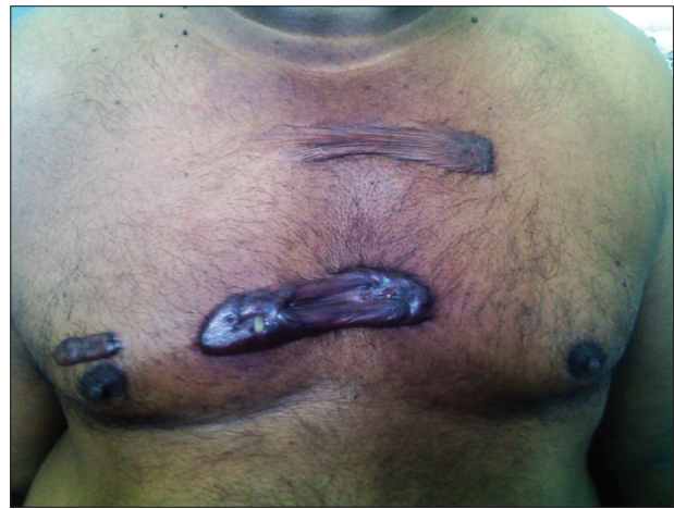
Figure 1: Clinical photograph of multiple keloid lesions on the chest

Keloids appear spontaneously or following trauma, may expand beyond the margin of the wound, and persists for years as in encountered in our case. NTM are known to produce subcutaneous lesion following minor trauma, the commonest etiological agent being M. marinum acquired following a swim in infected pools or immersion in aquaria. [5-7] Rapidly growing mycobacteria are a complex group of environmental mycobacteria which is either pigmented or non-pigmented. They are found ubiquitously in the environment including water, soil, dust, wild and domestic animals and fish. [8] They can grow in municipal water systems and distilled water. They are resistant to sterilizers, antiseptics, standard disinfectants including 10% povidine-iodine, 2% aqueous formaldehyde and 2% alkaline glutaraldehyde. [9] These mycobacteria are known to cause cutaneous infections, typically in association with trauma or clinical procedures as in our case. Their optimal incubation temperature ranges from 25°C to 40°C, and are characterized by a rapid growth rate (within 7 days) on subculture. M. fortuitum is one of several