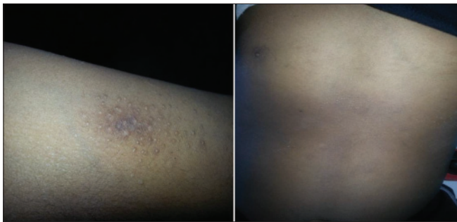
Figure 1: Right arm and front of the chest revealing skin lentiginosis and hyperpigmentation

BRRS is the combination of previous three recognized syndromes that is Bannayan-Zonana syndrome, Ruvalcaba-Myhre-Smith syndrome, and Riley-Smith syndrome. [1] DiLiberti, et al. suggested that Ruvalcaba-Myhre-Smith syndrome and Bannayan-Zonana syndrome represent phenotypic variability resulting from mutation at a single genetic locus and later proposed a new nomenclature, reflecting the unification of multiple syndromes that are now known to be caused by mutations in the PTEN gene. He proposed that