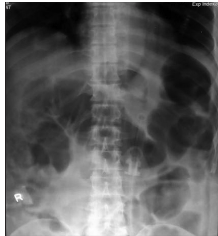
Figure 2: Abdomen roentgenogram taken on the day of distension post percutaneous endoscopic gastrostomy