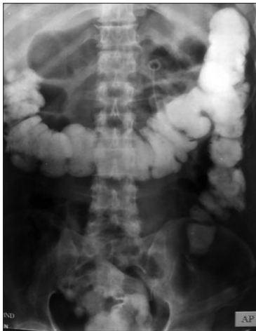
Figure 5: Post computed tomography scan abdomen roentgenogram after 72 h