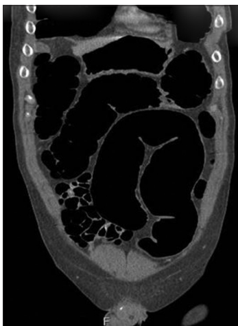
Figure 3: Computed tomography scan abdomen coronal image showing entire large bowel dilatation including rectum