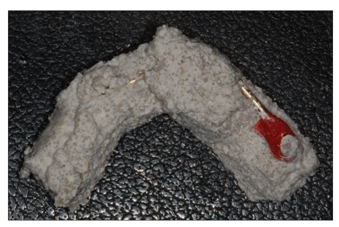
Figure 8: The mounted assembly of gold bar is invested (embedded in investment material), except the resin covered area around the fracture line for performing soldering