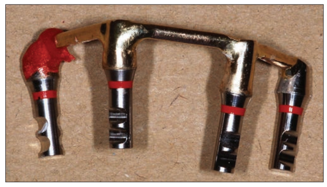
Figure 6: Compatible implant analogs (replica) secured to the gold copings on the bar retainer prior to mounting

In the present report, a simple, efficient, yet accurate technique for the repair of fractured bar retainer for a maxillary implant-retained overdenture is described. These fractures can be