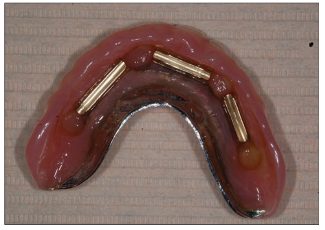
Figure 1: Intaglio surface of the metal framework reinforced maxillary implant overdenture with reduced palatal coverage showing three metal riders

U-shaped Dolder bars (H 3.0 mm, regular, Elitor® Straumann<sup>®</sup>) soldered to gold copings, made to fit passively. The framework-reinforced overdenture prosthesis incorporated three corresponding riders/ clips (Straumann<sup>®</sup>, Dolder matrix, regular) acting as matrices on the intaglio surface providing attachments to the bar retainer [Figure 1]. It was clear that the gold bar fractured mesial to the gold coping at implant 24 but was not displaced [Figure 2]. The maxillary implant overdenture prosthesis was found to be satisfactory with regards to fit, occlusion, aesthetics, and phonetics, however, was unstable due to the fracture in the supporting gold bar. The treatment plan suggested to the patient included the fabrication of a new bar retainer and maxillary IOD prosthesis. However, due to the patient's time restraint and after discussion of benefits and risks, an informed consent was developed and the decision was taken to retain the prosthesis and repair the gold bar using gold solder.