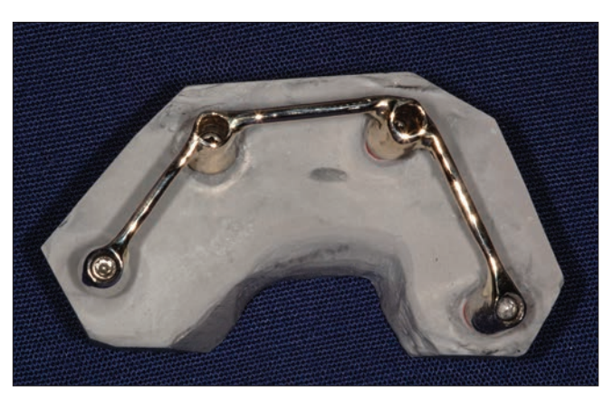
Figure 10: Repaired, finished, and polished gold bar retainer assembly, ready for intra-oral fit

the outcome of inherent weakness of the metal alloy, inadequate dimensions and design of the bar retainer, magnitude of occlusal forces and the antagonist<sup>[16]</sup> (fixed, removable prosthesis or natural dentition), inferior solder joints,<sup>[17]</sup> and fatigue failure.<sup>[18]</sup> The fracture was located at the solder joint mesial to the left distal maxillary implant coping. Repeated complain of loose bar retainer and soft tissue inflammation indicates incomplete seating of the coping on the implant platform,<sup>[19,20]</sup> i.e., a non-passive implant coping connection. Also, a diagonal discrepancy in approximation of the fracture line was observed, reinforcing the potential for non-passive fit. The problem was compounded further by comparatively apical placement of left distal maxillary implant. The continuous stress at the implant/coping connection due to non-passive fit, apical position of implant, high occlusal forces, and inferior solder quality resulted in fatigue failure.