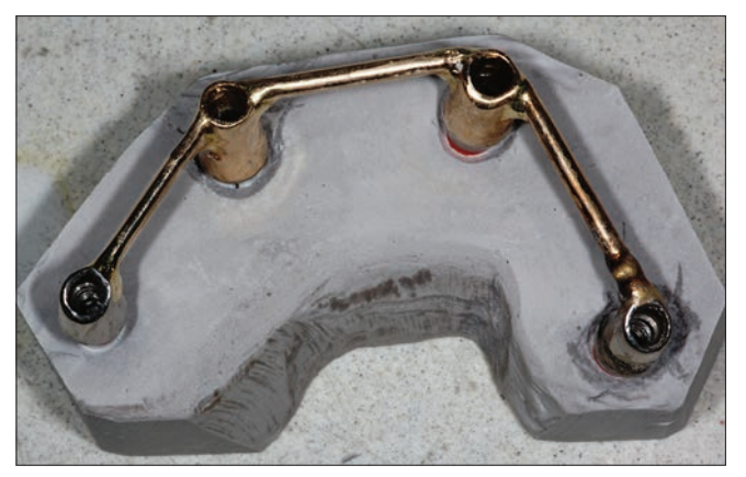
Figure 9: The soldered and divested gold bar assembly, prior to finishing and polishing