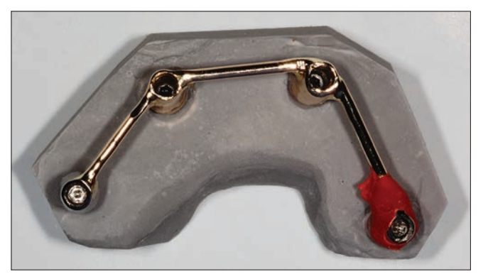
Figure 7: The gold bar retainer and implant analog assembly mounted in dental stone for positioning stability of fractured segments