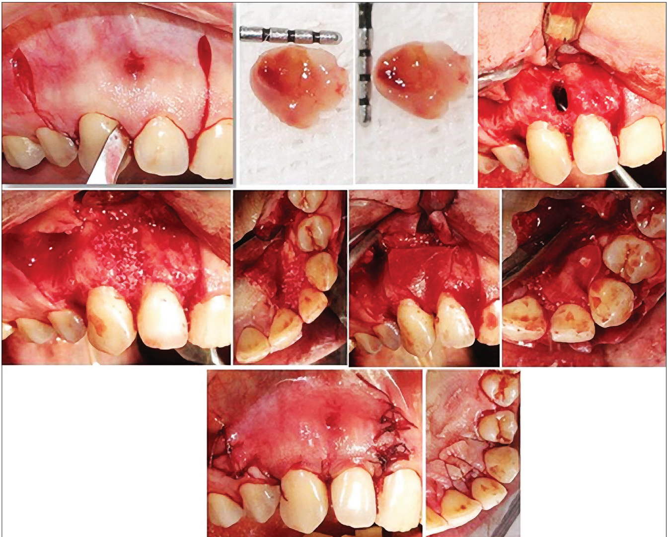
Figure 2: Surgical treatment of the lesion

and initial radiolucency disappeared at 6 months follow-up period [Figure 3].