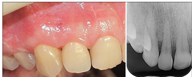
Figure 3: Clinical healing and radiographical image at the 6 months follow-up period

Lateral periodontal cyst, an uncommon noninflammatory lesion of the oral cavity, is an intraosseous cyst associated with the root of a vital tooth, which presents no signs or symptoms clinically. Occasionally, a small swelling of the gingiva or alveolar mucosa may be seen [7] and the diagnosis is generally established by means of a