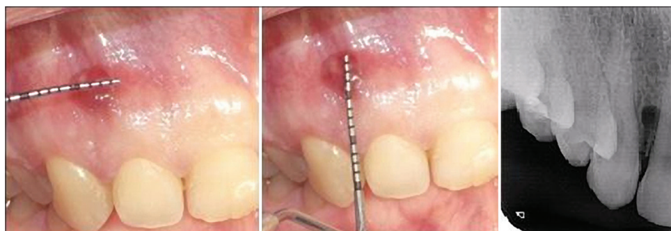
Figure 1: Clinical appearance and radiographical image of the lesion