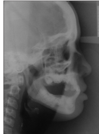
Figure 3: Cephalometric radiograph revealing increased lower incisor proclination (L1-MP), protrusion of lower lip (LL-E), reduced labiomental angle and posterior open-bite

Recent studies have shown that PFE is largely an inherited anomaly and that mutations in PTH1R genes explain several familial cases of PFE. [16] A number of known human syndromes give a clear evidence of the genetic origin of the eruption defect which manifests as part of the clinical features of the syndrome. These syndromes include cleidocranial dysplasia, Osteoglophonic dysplasia, Osteopetrosis, Rutherford syndrome, and GAPO syndrome [growth retardation, alopecia, pseudoanodontia (failure of tooth eruption), and progressive optic Atrophy]. [17]