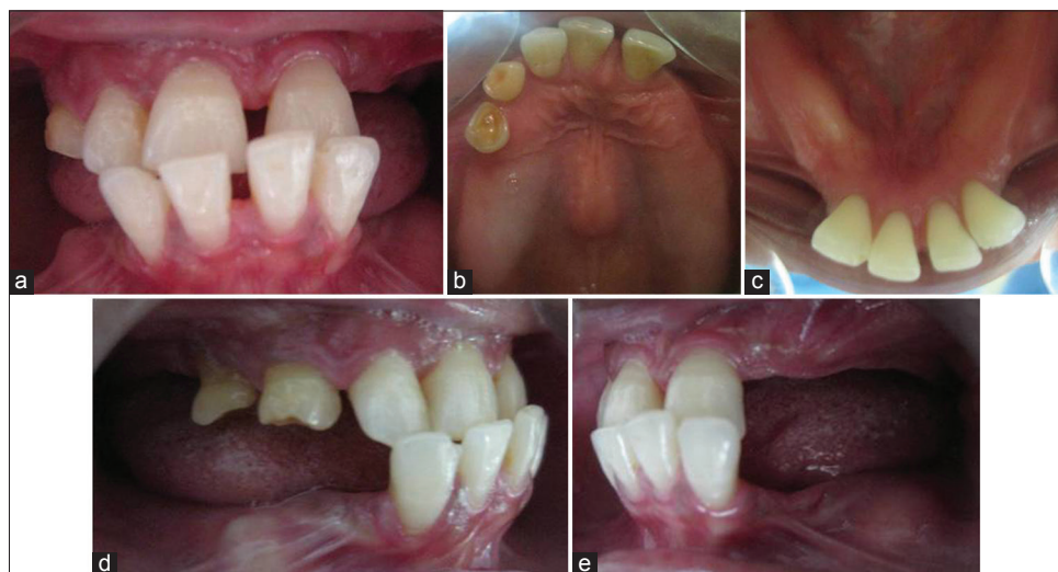
Figure 1: (a) Intraoral frontal photograph showing class III incisor relationship with erupted upper permanent central incisors, upper right lateral incisor and lower incisors. (b) Intraoral occlusal photograph of maxillary dental arch showing erupted 11, 12, 21, retained upper right D and E and torus palatinus. (c) Intraoral occlusal photograph of mandibular dental arch showing erupted 31, 32, 41 and 42. (d) Intraoral photograph showing posterior open-bite on the right side and bulging in the lower ridge. (e) Intraoral photograph showing posterior open-bite on the left side and bulging in the lower ridge

Panoramic radiograph [Figure 2] revealed two retained deciduous teeth, 13 unerupted permanent teeth in the maxilla and 12 unerupted permanent teeth in the mandible. A total of 25 unerupted teeth: 13, 14, 15, 16, 17, 18, 22, 23, 24, 25, 26, 27, 28, 33, 34, 35, 36, 37, 38, 43, 44, 45, 46, 47, 48. The upper left lateral incisor was located above the root apex of the upper left central incisor. The upper left canine and the first premolar were in transposition. However, the lower canines were horizontally impacted below the