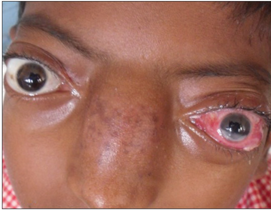
Figure 1: Preop status showing bilateral proptosis (left > right) with widened nasal bridge. Extensive conjunctival chemosis on the left side with exposure keratitis