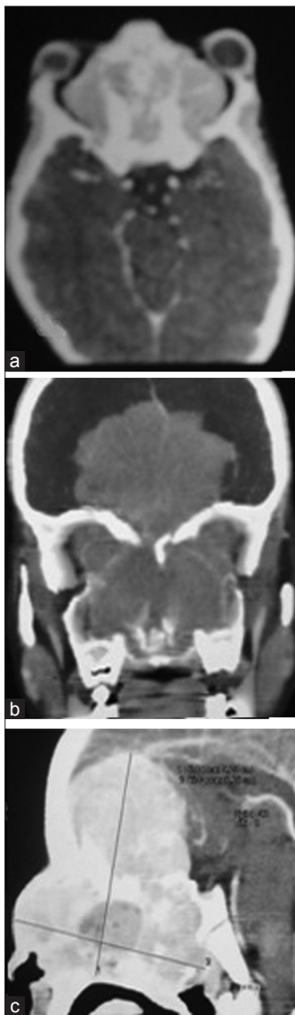
Figure 2: (a) Axial, (b) sagittal and (c) coronal sections of CT brain contrast study showing well enhancing lesion in basifrontal region extending through the ethmoid sinuses into bilateral nasal cavities, orbits, and maxillary sinuses

He was subjected to chemo-radiotherapy subsequently. Following four cycles of chemotherapy with vincristine (1 mg), doxorubicin (70 mg), cyclophosphamide (1100 mg) intervened with ifosfomide (D1-D4, 1.7 g), and etoposide (D1-D4, 90 mg). After four cycles of chemotherapy, intensity modulated radiotherapy on linear accelerator (Clinac-iX-3665), 1.8 Greys per fraction, 31 fractions (total dose- 55.8 Greys) was given. He was continued on chemotherapy (described above) for 10 cycles. He is planned to get chemotherapy for two more cycles. Patient was doing well at follow up of 11 months and there was no apparent clinical or radiological [Figure 4] evidence of local recurrence or systemic metastasis (No hot spot on bone scan).