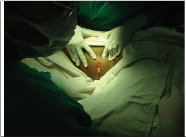
Figure 1: Incision starting at the tip of the 12 th rib in the lateral abdominal wall