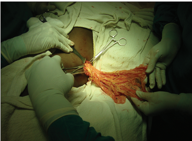
Figure 3: Omentum taken out through the wound