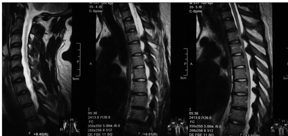
Figure 1: Sagittal T2-weighted image MRI of cervical and upper thoracic spine showing Th2–Th3 ligamentum flavum hypertrophy with intramedullary hypersignal associated with narrowed spinal canal all over the thoracic spinal cord