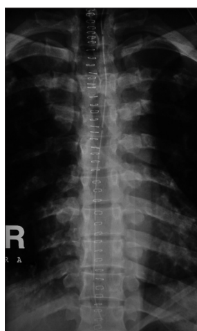
Figure 4: Antero-posterior thoracic spine X-ray postoperatively showing extended Th2–Th11 laminectomy

the spinal canal stenosis. OLF may be idiopathic or may occur in the context of other diseases such as ankylosing spondylitis