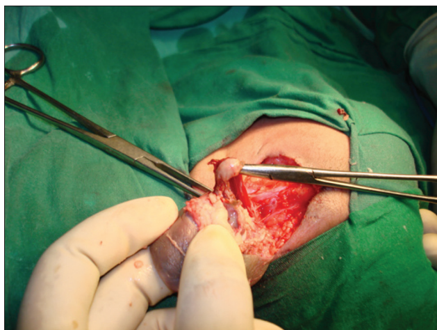
Figure 1: Teratoma being dissected from MMC