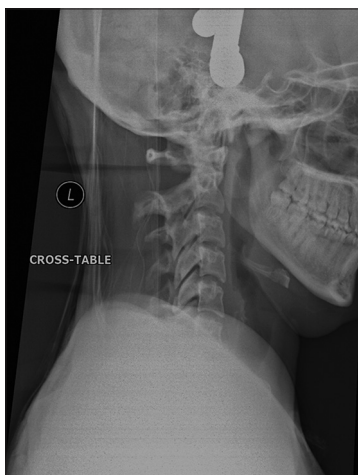
Figure 3: Lateral view cervical spine-X-ray alignment after 8 pounds traction

in the pinned HALO, she was transitioned into a “cyber” neck support and subsequently placed into an aspen collar which