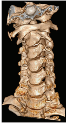
Figure 1: Computed tomography neck three-dimension reconstruction - ventral view showing anterior subluxation of the right L1 facet