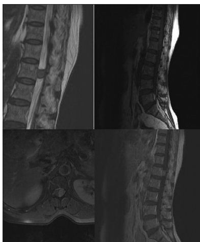
Figure 1: Magnetic resonance imaging lumbar spine showing the lesion that is iso-intense on T1-weighted and extremely hypointense on T2-weighted imaging along with homogenous contrast enhancement evident on sagittal and axial images