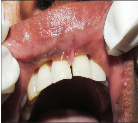
Figure 1: Swelling associated with high frenal attachment

major part of the lesion. [6] Lopes et al. have reported TN with mature ganglion cells, called as pseudoganglioneuroma.