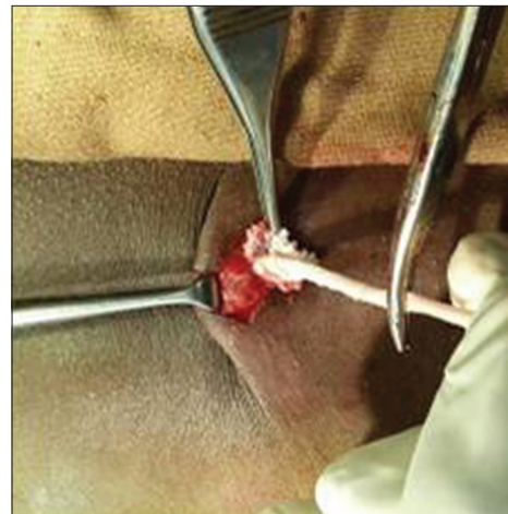
Figure 6: Calcification and fibrosis along shunt pathway during the surgery of shunt removal of the second patient