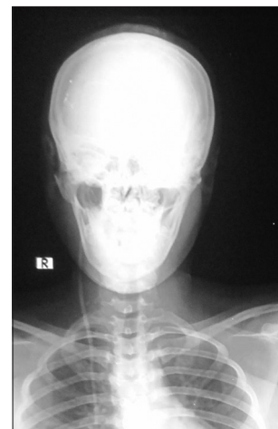
Figure 2: Plain X-ray of the first patient showing calcification around the shunt tube in the neck

Calcification of the shunt tube pathway and related dysfunction of VP shunts are rare events in neurosurgical practice. Very