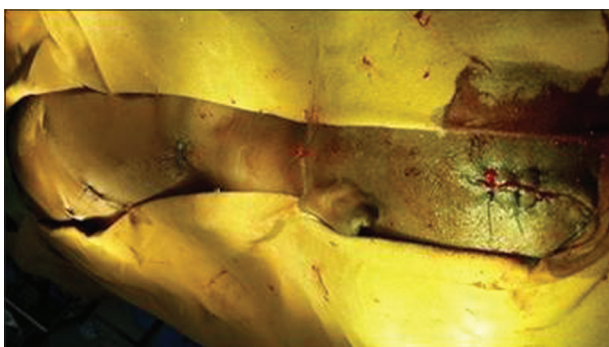
Figure 7: Multiple incisions closed after shunt removal of the second patient

few cases of shunt rupture and calcification were reported in literature, and these conditions usually occur as a long-term complication of VP shunting.