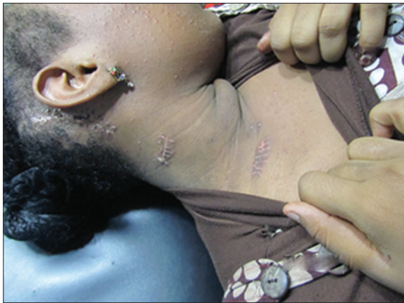
Figure 3: The scars in the head and neck of the first patient following surgery