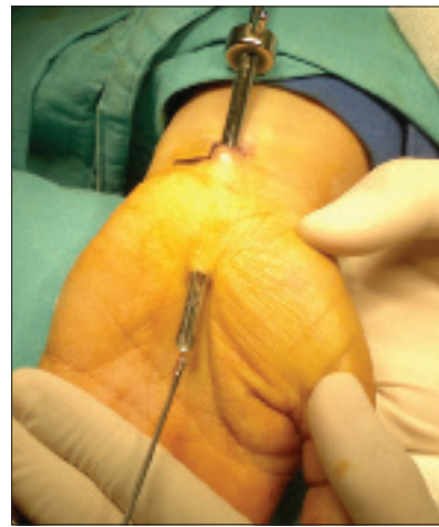
Figure 2: Trochar enables to use the exiting hole. Endoscope and ligament knives are essential to start the surgery