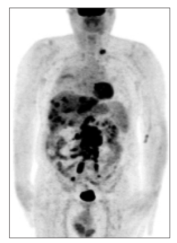
Figure 1: Pre-treatment; positron emission tomography scan showing multiple metastatic bilateral hepatic lesions and retroperitoneal lymphadenopathy from primary salivary gland carcinoma

Currently, there are no standard treatment guidelines for metastatic salivary gland cancers; however, two phase II trials of Her2/neu-targeted therapies in salivary carcinomas are promising [Table 1]. Agulnik et al. reported a trial of lapatinib in 62 salivary tumor patients with EGFR and Her2/neu expression, the outcome being either stable or progressed disease with no obvious improvements, knowing that adenocarcinoma accounted for only 11% of tumors. [12] Similarly, Haddad et al. reported the use of trastuzumab in 14 patients, with Her2/neu over-expression. Fifty percent