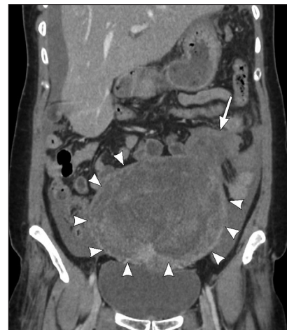
Figure 4: Post contrast coronal reformatted computed tomography image showing heterogenous mass “arrow heads” with a defect at its superior aspect “arrow” in keeping with perforation as well as moderate amount of free fluid of high density, suggesting hemoperitoneum

Gross pathological examination revealed enlarged uterus measured 15 × 14 × 9 cm. Bisected uterus showed solid mass measured 15 × 12 × 7 cm arising from the fundus with evidence of perforation. On microscopic examination, a cellular leiomyoma with evidence of hemorrhagic infarction is found. No malignant cells were identified. The uterine cervix, fallopian tubes, and ovaries were normal.