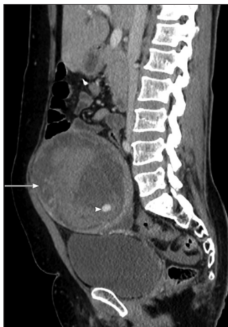
Figure 3: Post contrast sagittal reformatted computed tomography image showing heterogenous pelvic mass “arrow” and high attenuation area inside it “arrow head,” suggesting active contrast extravasation