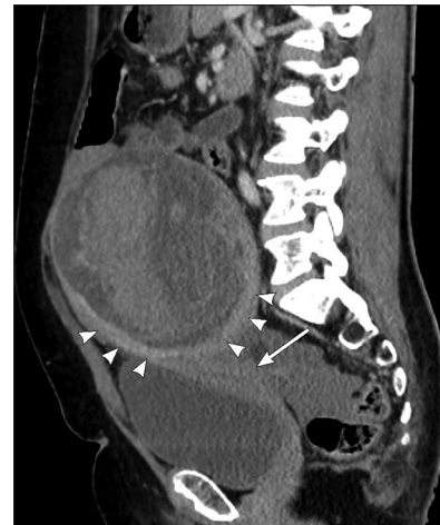
Figure 2: Post contrast sagittal reformatted computed tomography image showing heterogenous pelvic mass “arrow heads” arising from uterine fundus “arrow”