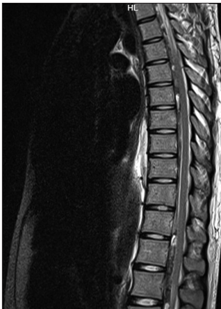
Figure 3: Magnetic resonance imaging dorsal spine sagittal cuts showing epidural haematoma