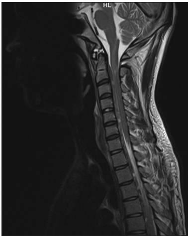
Figure 1: Magnetic resonance imaging cervical spine sagittal cuts showing epidural haematoma

department with the complaints of severe neck pain for 6 days; followed by acute onset paraparesis and urinary retention from 1 day. On examination patients power in lower limbs was 0/5 and in upper limb it was 1/5, reflexes were brisk. Patient was a known case of hyperhomocysteinemia and was on regular medical treatment. Patient had a history of sagittal sinus thrombosis for which he was on tablet warfarin 5 mg. Magnetic resonance imaging (MRI) whole spine revealed extensive hematoma anterior to cord extending from C2 to L4 level with a maximum thickness in cervical level with hematomyelia. Figures 1-4 INR was 2.7 and PT was prolonged. Patient was started steroids and supportive treatment along with correction of coagulation profile with 6 units of fresh frozen plasma and Vitamin K 10 mg once daily. As the hematoma was