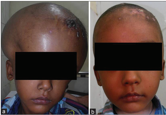
Figure 1: (a) Clinical photograph of the patient taken 35 days after trival trauma (before needle aspiration) showing large head due to circumferential scalp swelling. (b) Clinical photograph of the patient taken 10 days after needle aspiration of scalp collection showing reduction in head size