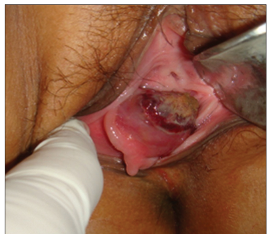
Figure 2: Vaginal metastases