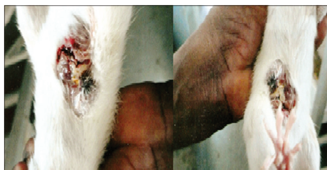
Figure 2: Ulcer produced in the rat treated with 7,12-dimethyl benzantracene