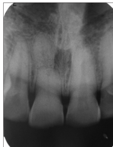
Figure 1: Pre-operative radiograph

involve maintaining pulp vitality by immobilizing the coronal segment. The first step for management of horizontal root-fracture cases is to reposition the tooth and confirm its position radiographically. [2]