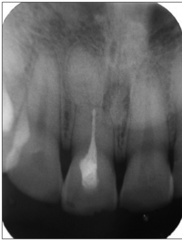
Figure 4: One year post-operative radiograph