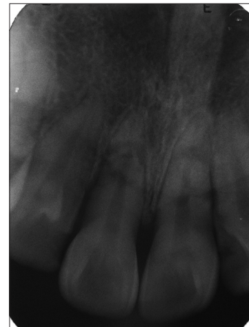
Figure 7: One year post-operative radiograph

The histological reactions at the fracture line are categorized into four types: (I) Interposition of calcified tissue (callus formation); (II) interposition of connective tissue, which is characterized by peripheral rounding of the fracture's ends; (III) interposition of bone and connective tissue, radiologically characterized by the clear separation of the two fragments; and (IV) interposition of granulation tissue, caused by an infected or necrotic pulp. [2] Type I is found most commonly in root-fractured teeth in which the coronal fragment is not or only slightly dislocated. Type II often results after lateral dislocation or extrusion of the coronal fragment. If the trauma occurs before growth of the alveolar process is complete, the coronal fragment continues to erupt, but the apical fragment remains in its pre-trauma position. As a result, bone and connective tissue grow between the two fragments (type III). In type IV, infected or necrotic pulpal tissue causes an inflammatory reaction in the fracture line. [2]