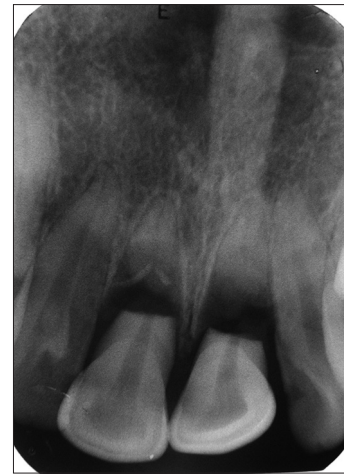
Figure 5: Pre-operative radiograph