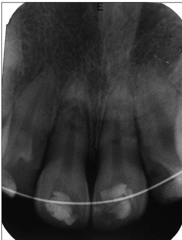
Figure 6: Fractured segments repositioned