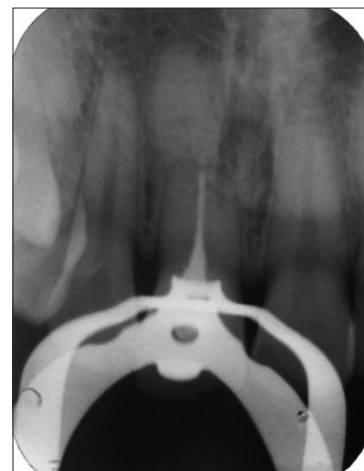
Figure 3: Obturation radiograph