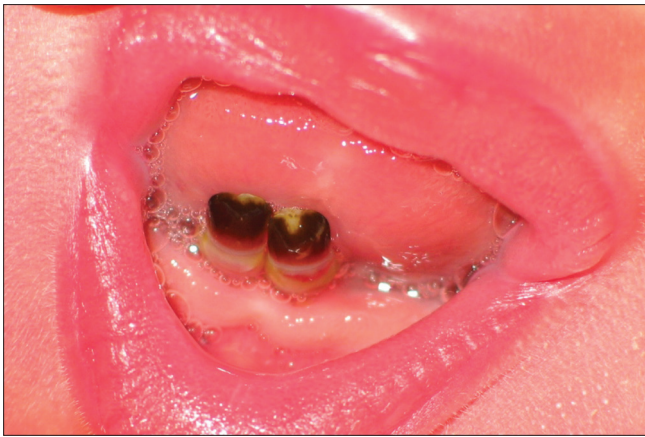
Figure 1: Intraoral appearance of natal teeth