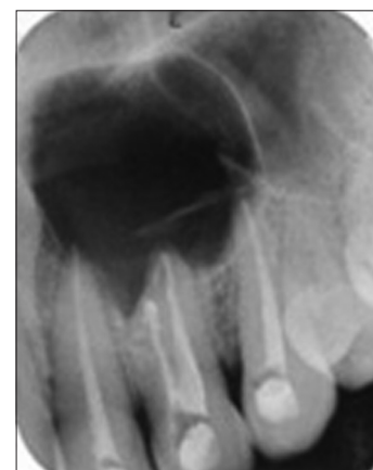
Figure 4: Postobturation radiograph