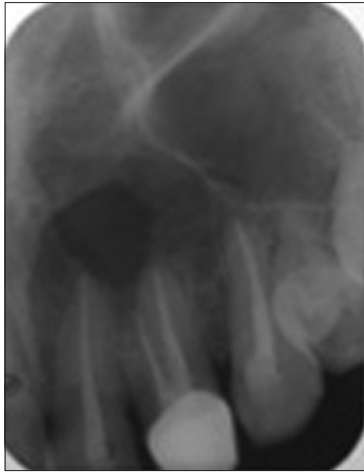
Figure 5: Radiograph after 1-year showing healing

invagination, create a tooth with a single canal, and do conventional endodontic treatment. [7] For cases of type III, invagination presents communication with the oral cavity. [8] Some authors have described nonsurgical treatments; [9] and there are also periodontal surgery case reports. [10] Extraction is indicated in case of teeth with poor prognosis. [11] This was a case of type III dens invaginatus, having two orifices, the main canal and the invagination, both exits separately at the apex. The apical exit of the invagination is the pseudo foramen and that of the main canal is the apical foramen.