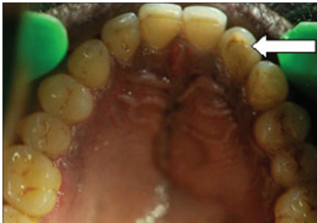
Figure 1: Maxillary lateral incisor with dens invaginatus

Types I and II dens invaginatus do not present treatment problems. It is only necessary to remove the