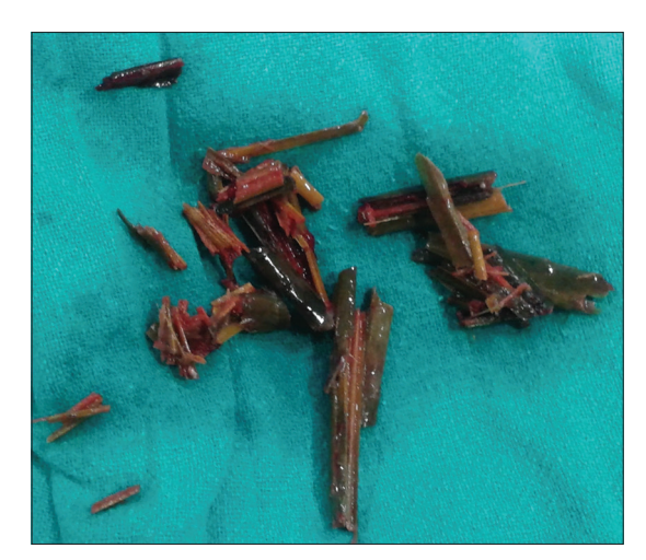
Figure 2: Small pieces of bamboo stick

In our case, the bony defect was in the cribriform plate from where the foreign body has entered the brain parenchyma. As discussed earlier, this patient presented to us very late. The initial CT scan was not available, and there was no obvious evidence of foreign body. The only significant history was insertion of Ryle's tube and its removal after failed feeding trial. In the absence of CT scan, we assumed the Ryle's tube as the main cause of rhinorrhoea. However, the foreign body was removed through a mini craniotomy rather than going for the endoscopic transnasal approach, which is considered to be less invasive. The important message is that one should never put a Ryle's tube through the nose in a patient with history of head injury, especially when the scans are not