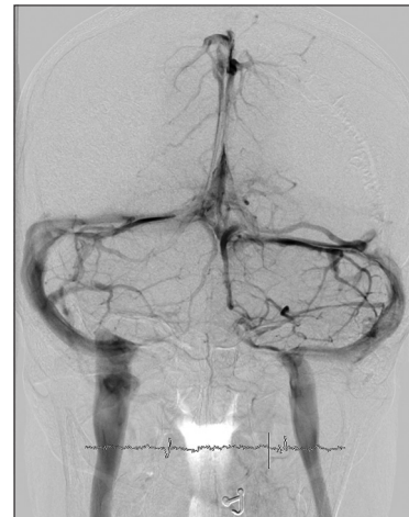
Figure 1: Digital subtraction angiography of brain showing normal venous drainage (another patient)

VOGMs are associated with several arterial and venous anomalies. In most cases, these anomalies present in