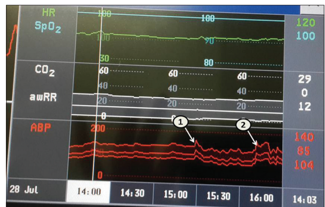
Figure 2: Haemodynamic changes from the time of dural opening to 30 min after the coronary spasm. (Arrow 1) the period at which hypertension and ST depression occurred. (Arrow 2) Episodes of hypertension following the restart of surgery