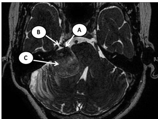
Figure 1: Magnetic resonance imaging brain (T2-weighted drive) shows the vestibular schwannoma with distorted trigeminal nerve. A: Trigeminal nerve, B: Meckel's cave, C: Vestibular schwannoma

A 37-year-old American Society of Anesthesiologists (ASA) Grade 1 woman (height 154 cm, weight 64 kg) underwent a right retromastoid suboccipital re-craniotomy and excision of a recurrent vestibular schwannoma [Figure 1] in left lateral position. Patient was anaesthetised using propofol (3 mg/kg), fentanyl (3 µg/kg) and vecuronium (0.15 mg/kg). Anaesthesia was maintained using air, oxygen and isoflurane (0.9-1 minimum alveolar concentration) and vecuronium infusion. She was haemodynamically stable until the dural opening.