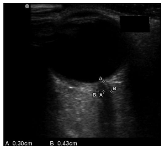
Figure 1: Optic nerve sheath diameter measured 3 mm behind the globe

There are few limitations in this study. The study was conducted in a single centre and by a single investigator. Interobserver variability could not be studied. Paediatric population was excluded in the