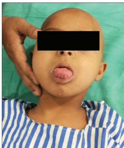
Figure 1: The restricted head and neck movement with macroglossia

were made in anticipation. Patient was premedicated with intravenous (IV) midazolam 0.05 mg/kg, glycopyrrolate 0.01 mg/kg and fentanyl 1 µg/kg. After preoxygenation for 3 min, anaesthesia was induced with propofol 2 mg/kg. Following confirmation of adequate bag-mask ventilation, neuromuscular relaxation was achieved with succinylcholine 1.5 mg/kg intravenously. The table was adjusted to the head down position with flexion of both the knees. The Airtraq ® was introduced in the midline, over the base of the tongue and the tip positioned in the vallecula. The patient was successfully intubated using an Airtraq ® optical laryngoscope (size-2) in a neutral position. A continuous flow of oxygen was maintained throughout the procedure via a nasal cannula to prevent hypoxia and defog the optical device. Anaesthesia was maintained with a mixture of nitrous oxide and oxygen in a ratio of 60:40, sevoflurane 1% and 0.1 mg/kg/h vecuronium infusion. The intra-operative course was uneventful, and the patient was extubated after reversal of neuromuscular blockade.