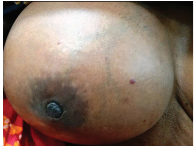
Figure 1: The breast lump with glistening of skin and venous prominence

Myeloid sarcoma presenting as a breast mass is uncommon. [1-3] An extensive search of the previous literature revealed 67 previously reported cases, of which 66 occurred in women and one case occurred in man. Thirty-seven of these previously reported cases are tabulated in Table 1, with a wide age range of 16–72 years [Table 1]. Very few cases have been reported as an isolated mass with no significant history or subsequent development of AML while on clinical follow-up. [4] All the patients presented as asymptomatic breast mass either detected by self-examination or by mammographic studies. Right breast involvement is more common than the left while single case has been reported which was bilateral. The cases usually present with a lump and may be associated symptoms pain, but nipple inversion and discharge are usually absent. [4,5] In our case, it was a solitary firm breast lump without pain, nipple change, and secretion.