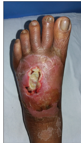
Figure 1: Ulcer (5 cm × 7 cm) over dorsum of the foot with necrotic base and surrounding edema

AST was done by standard Kirby–Bauer disc diffusion method. Antibiotic sensitivity test (AST) interpretations were done based on Clinical and Laboratory Standards Institute document M45 – Methods for antimicrobial